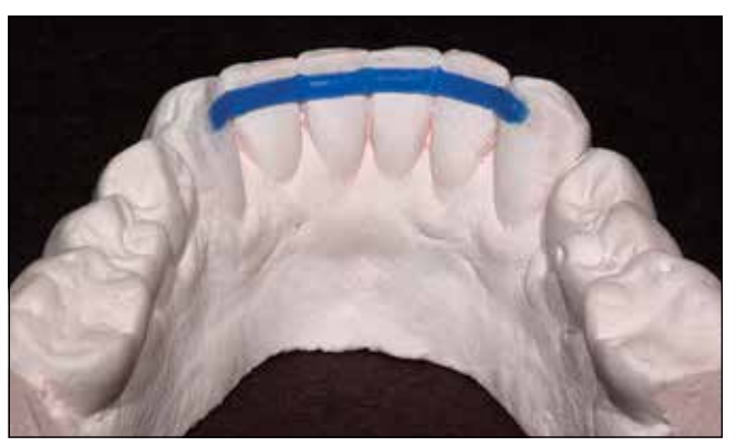
Fig. 2. Fast-set stone cast with 12-gauge half-round wax at the level of the interproximal contacts to maintain gingival embrasure space.