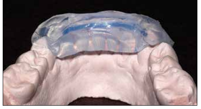
Fig. 3. Clear vinyl polysiloxane matrix extending past the incisal edge and onto adjacent teeth for accurate intraoral positioning.

resin to the teeth, thin with air, and light polymerize for 10 seconds. Wet the Ribbond-ULTRA with a thin layer of unfilled resin. Apply a thin band of filled composite resin to the teeth at the level of the interproximal contacts and press in the Ribbond-ULTRA, tucking into the interproximals for close adaptation. Light polymerize for 60 seconds. Cover the surface with flowable composite and polymerize for 60 seconds. Contour and polish with carbide finishing burs and rubber points.