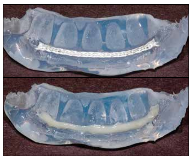
Fig. 4 Top. Ribbond in matrix recess formed by the wax shape. Bottom. Ribbond pressed into the filled composite resin. The matrix will adapt the composite resin and place Ribbond closely against the teeth.

Clean the anterior teeth (Fig. 1). Obtain an alginate impression and pour it in fast-set stone (Snap-Stone, Whip Mix Corporation). Separate the cast after 5 minutes and place 12-gauge half-round wax (Otto Frei) at the level of the contacts (Fig. 2). Tack the wax down with a heated wax instrument and place indents to ensure close adaptation of the Ribbond interproximally. Place a 3 mm layer of clear vinylpolysiloxane (Memosil, Heraeus Kulzer) to cover the lingual surface and incisal edge (Fig. 3). Isolate the anterior teeth. Measure a length of Ribbond that fits into the clear matrix recess. Etch the teeth with 37% phosphoric acid, rinse, and dry. Apply unfilled resin to the teeth, thin with air, and light polymerize for 10 seconds.