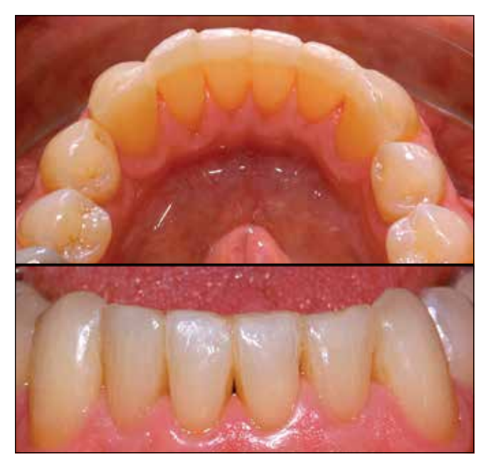
Fig. 5 Top. Lingual view of finished composite resin/Ribbond bonded retainer. The surface is smooth and continuous with natural contour for patient comfort. Bottom. Facial view of bonded retainer. Note the open gingival embrasure space to facilitate oral hygiene with floss threaders.